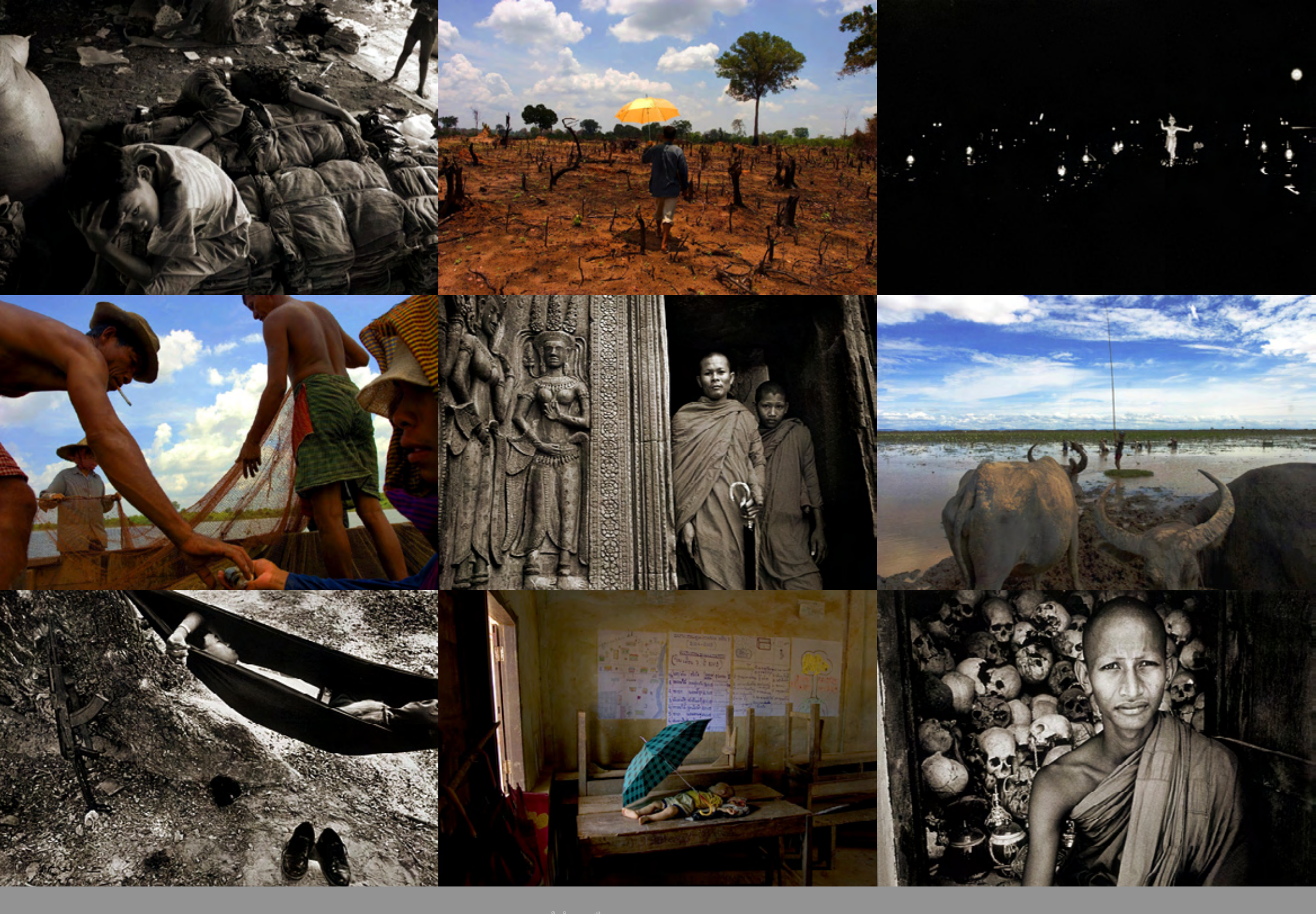
นอร์หรัทอวลร์เล ANGKOR SIEM REAP CAMBODIA 200